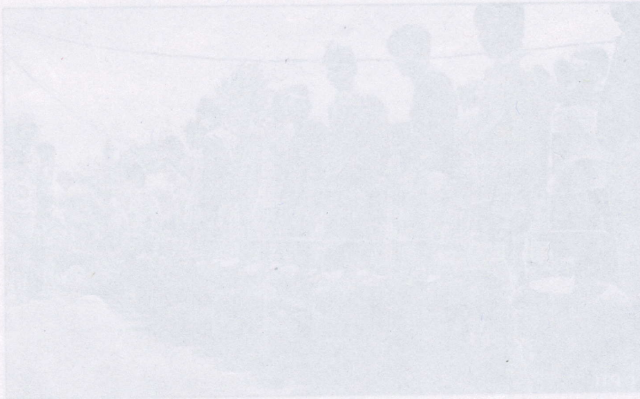
Government is cracking down on illegal sale of gas cylinders

The cost of every additional cylinder will depend on the prevailing market price. Many people are purchasing cylinders from the black market at Rs 1,200-1,300 per cylinder.